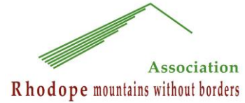
Rhodope mountains without borders