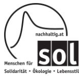
SOL – People for solidarity, ecology and lifestyle, Austria